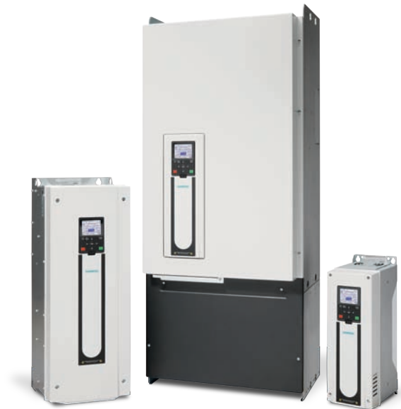
Migration kits based on frame size sold separately.